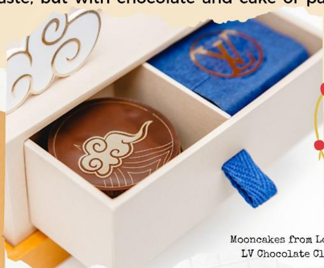
Mooncakes from Louis Vuitton: LV Chocolate Cloud Monogram