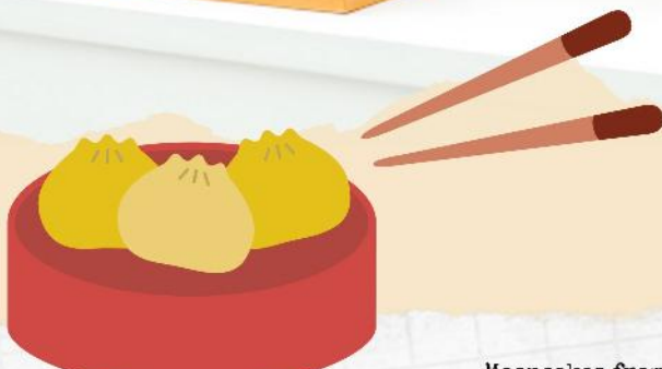
Mooncakes from AAPE: Camo Tin Lunch box and Lantern